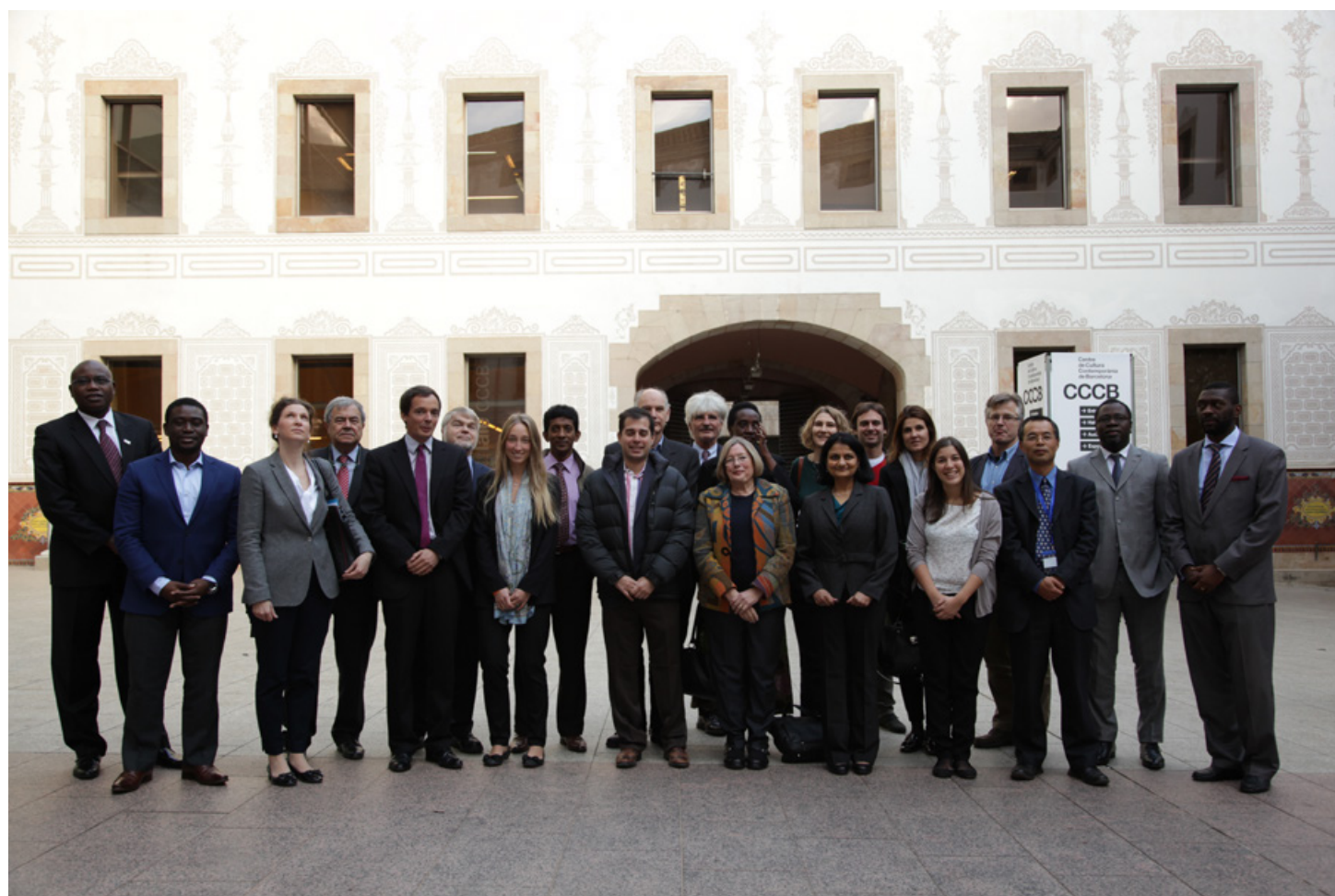
Participants of the Expert Group Meeting “Ways Forward to Achieving Affordable and Inclusive Housing Finance for all: Roles and responsibilities for UN-Habitat and partners” . Barcelona, 11-12 December 2014.